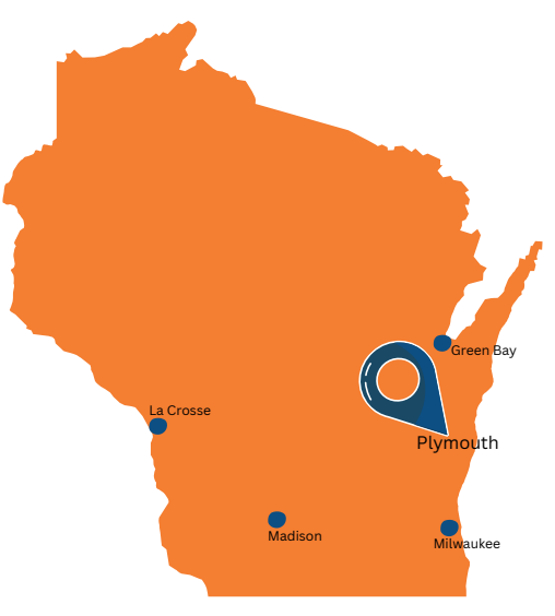
Plymouth Wisconsin is an hour drive from either Milwaukee or Green Bay, and 2.5 hours from Chicago, IL.